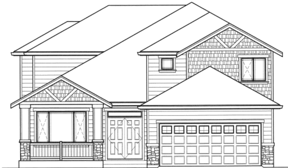
FRONT ELEVATION 'B'

In order to continually improve the features of its homes, Capstone Homes, Inc., reserves the right to make changes and modifications to floor plans, specifications and materials without notice. Sales prices are subject to change.