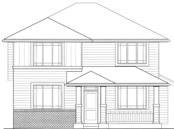
○ FRONT ELEVATION B

In order to continually improve the features of its homes, Capstone Homes, Inc., reserves the right to make changes and modifications to floor plans, specifications and materials without notice. Sales prices are subject to change.