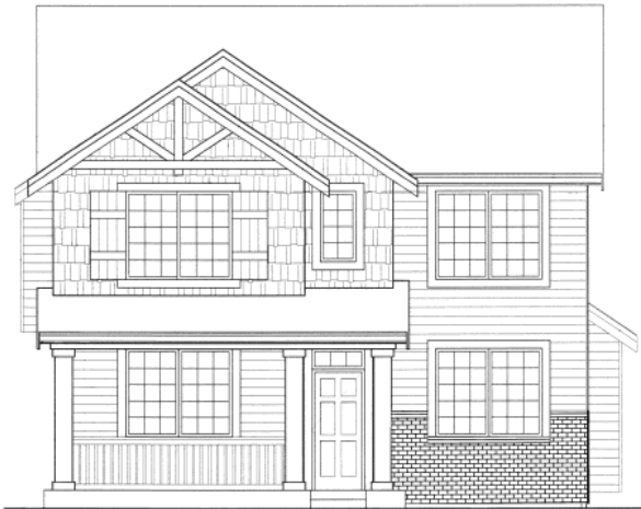
○ FRONT ELEVATION A