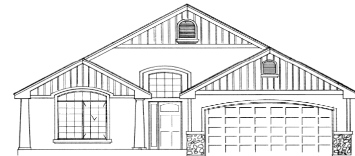
FRONT ELEVATION "C"

In order to continually improve the features of its homes, Capstone Homes, Inc., reserves the right to make changes and modifications to floor plans, specifications and materials without notice. Sales prices are subject to change.